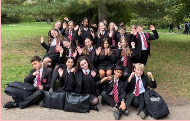
We made it through the maze!